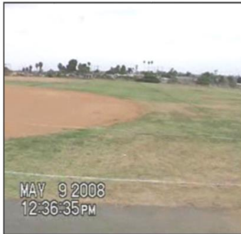
Girls' Softball Field Grass

Note: No female athletic facility made up for inequity between softball and baseball