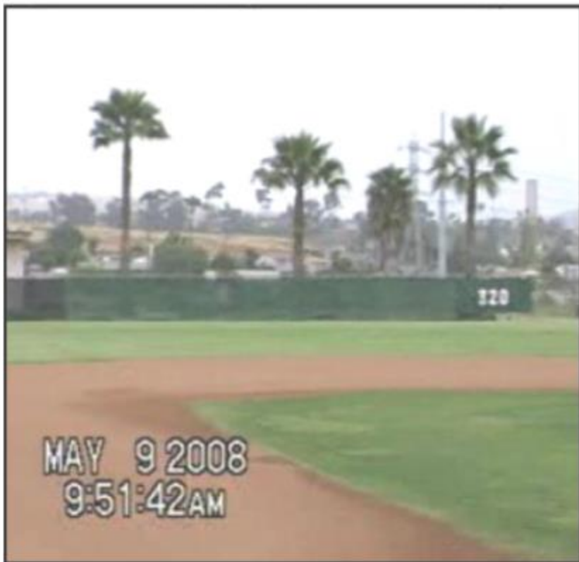
Boys' Baseball Field Grass